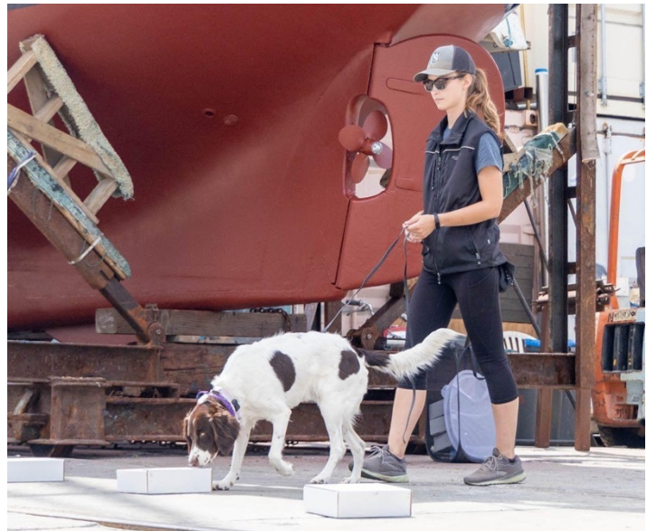
Iris at 18 months old practicing Scentwork Containers at a boatyard.

NW101 does an excellent job of breaking down the process of introducing your dog to a target odor and building up in small steps towards basic searching. It also touches on the basics of odor storage and handling, appropriate gear for the dog and handler, the basic structures of AKC Scentwork and NACSW, how to best handle your dog to set them up for success, and more.